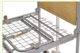
Mattress platform extension – increasing length to 84 inches