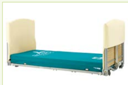
Head and foot board bumpers