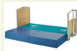
Safety mat provides same height as a FloorBed® with 6 inch foam mattress