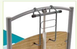
Mattress pump bracket