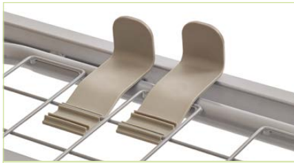
Width adjustable mattress guides