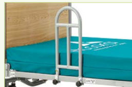
Assist bar to assist with bed mobility