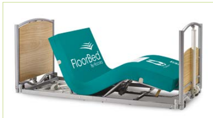
Backrest and kneebreak functions