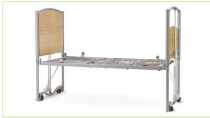
No trailing wires