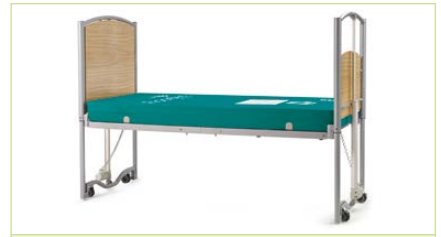
Full nursing height